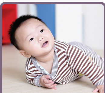
SERVICES for INFANTS/TODDLERS